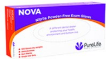
NOVA Nitrile Powder-Free Exam Gloves

160/package $8.60 19% SAVINGS MSRP $10.65