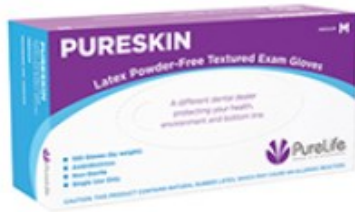
PureSkin Powder-Free Latex Exam Gloves

100/package $3.77 41% SAVINGS MSRP $6.49