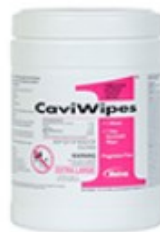
CaviWipes Disinfectant Wipes

100/package $3.77 41% SAVINGS MSRP $6.49