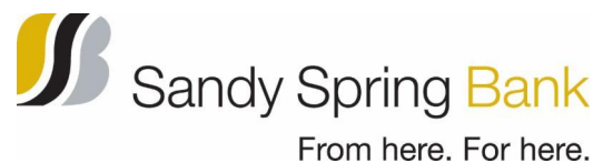
Sandy Spring Bank