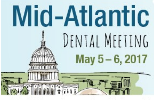
Walter E. Washington Convention Center | Washington, DC