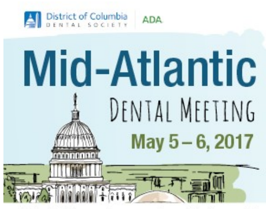
Walter E. Washington Convention Center | Washington, DC

Only hands-on workshops and the CNA HealthPro Dental Professional Liability Risk Management Seminar have low additional fees.