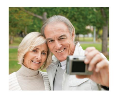
Practice Appraisals & Sales