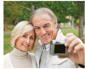
Practice Appraisals & Sales