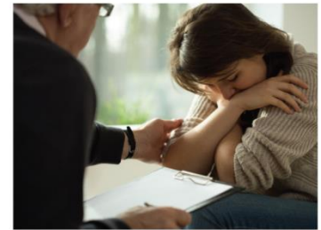
Practice Protection Plan