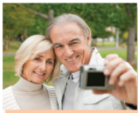
Practice Appraisals & Sales