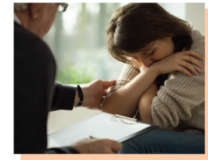
Practice Protection Plan