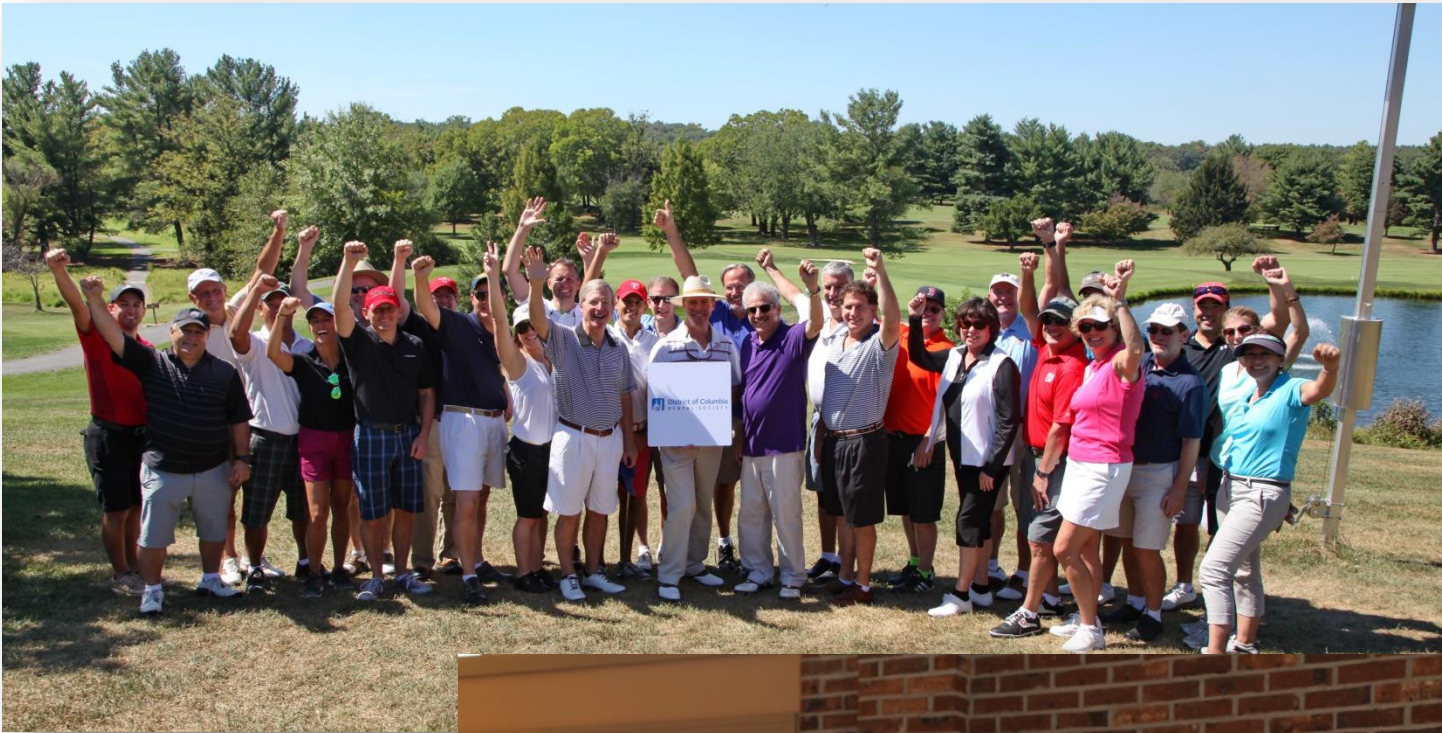
Top: An excited group of dentists, sponsors, and friends!