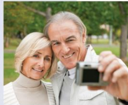
Practice Appraisals & Sales