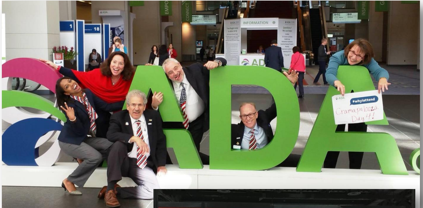
Top: The Committee on Local Arrangements having a blast at the ADA 2015 annual meeting!