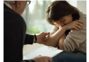
Practice Protection Plan

Trust your practice with the firm that has an impeccable reputation for service, experience and results. Call today for a free initial consultation.