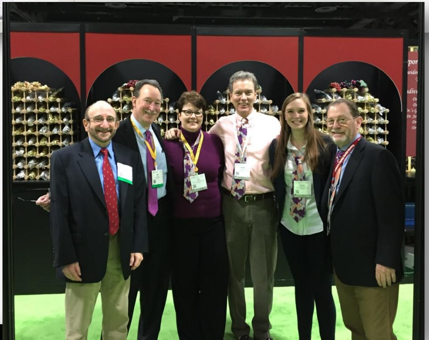
Right: Volunteers and DCDS staff working the Foundation's Wall of Wine at ADA 2015