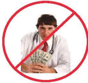
Dental Supply Companies Who Also Act As Brokers?