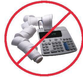
Your Accounting Firm Who Offers Brokerage Services?

Is it a dual-rep brokerage firm? NO You cannot serve two masters. Dual-rep firms charge buyers hefty fees, and as a result, their strategies usually negatively affect the final selling price and/or terms the owners agree to when selling. In addition, if a buyer has to choose between two similar practices- where one requires a substantial fee to a dual-rep firm, and the other does not- which practice and brokerage firm will they choose?