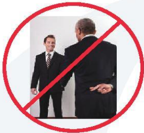
Dual-Representation Brokerage Firms?