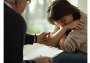
Practice Protection Plan

Trust your practice with the firm that has an impeccable reputation for service, experience and results. Call today for a free initial consultation.