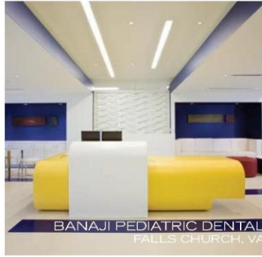
BANAJI PEDIATRIC DENTAL FALLS CHURCH, VA