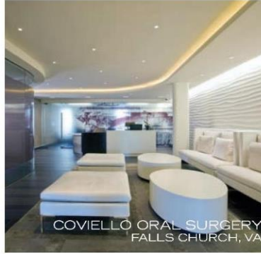
COVIELLO ORAL SURGERY FALLS CHURCH, VA