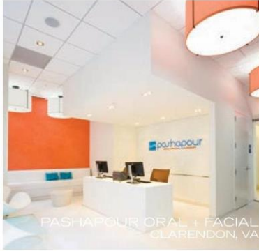
PASHAPOUR ORAL & FACIAL CLARENDON, VA