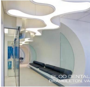
BLOO DENTAL BRAMBLETON, VA