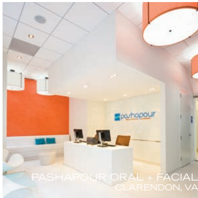
PASHAPOUR ORAL + FACIAL CLARENDON, VA