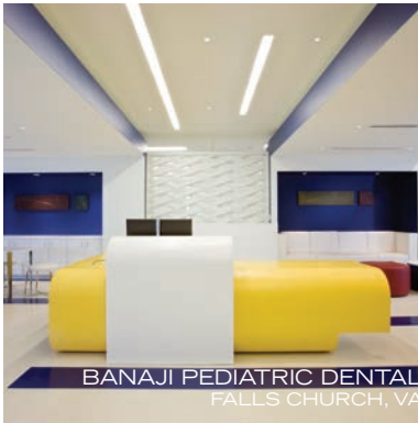
BANAJI PEDIATRIC DENTAL FALLS CHURCH, VA