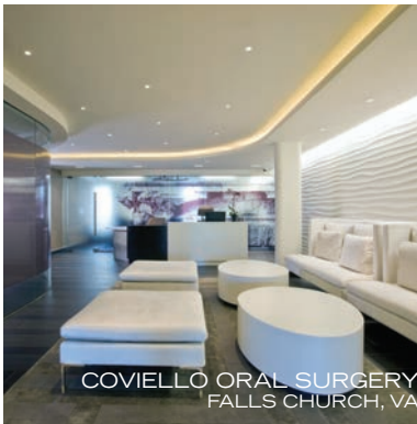
COVIELLO ORAL SURGERY FALLS CHURCH, VA