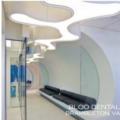
BLOO DENTAL BRAMBLETON, VA