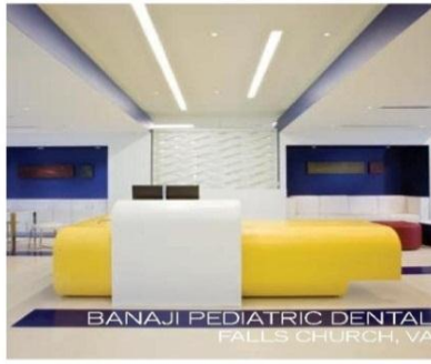
BANAJI PEDIATRIC DENTAL FALLS CHURCH, VA