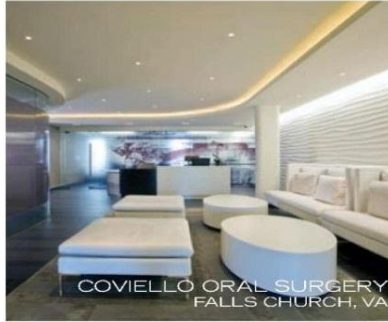
COVIELLO ORAL SURGERY FALLS CHURCH, VA