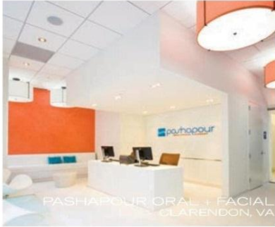
PASHAPOUR ORAL + FACIAL CLARENDON, VA