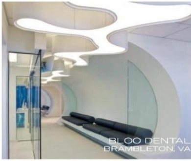
BLOO DENTAL BRAMBLETON, VA