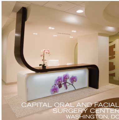
CAPITAL ORAL AND FACIAL SURGERY CENTER WASHINGTON, DC