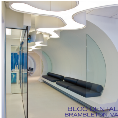
BLOO DENTAL BRAMBLETON, VA

Office space for rent or purchase in Tysons Corner. The office is fully renovated and is paper less with high technology. The office has 3 fully equipped operatories. For more information please call 703 725-6130.