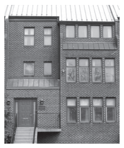
D.C. Dental Society Office

If you are in the neighborhood please stop by to say hello.